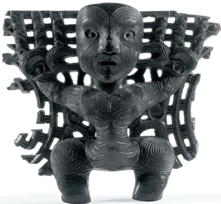
above: Pare (door lintel), Te Aitanga a Mahaki (attributed). Museum of New Zealand, Te Papa Tongarewa (01000044)

He taonga whakahirahira ngā waihotanga i hangaia e te ringa Māori o mua, ā, me tiaki tonu mō ngā rā e heke mai nei. Ko tā Te Pouhere Taonga mahi ko te āwhina i ngā kaupapa a hapū, a iwi hoki ki te tiaki tonu i ēnei taonga mā te Māori Buildings Conservation Programme . Ko ngā wharenuī, wharekai, whare karakia, pātaka, pouhaki, tohu whakamaharatanga, waka me etahi atu taonga anō hoki i ahu mai i te Māori he mea ahurei mō te hanga me te rerehua o te āhua. He momo wero te tiaki i ēnei taonga, ā, me whai mōhiotanga mātanga mō ngā tikanga tiaki taonga o mua, o nāianeī hoki ka tika.