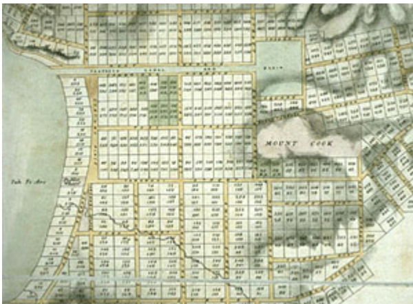
Town of Wellington (detail), W. M. Smith, 1840. New Zealand Company

The core of Wellington's existing CBD (excluding the reclaimed land) is based on the Wellington town plan of 1840 by William Mein Smith (see below) who was the chief surveyor of the New Zealand Company. The plan provided for 1100 town sections surrounded by additional country 100-acre country lots. To achieve the concentration ideals of Wakefield, the town sections and country lots were separated by a green town belt. The street network consisted of a number of quays along the foreshore and arterial roads leading up the main valleys. The zoning provisions were restricted to reserves for Maori (the Wellington tenths), and reserves for public institutions established by Fenton Mathew. The street network, allotment pattern, the green belt and the public reserves remain key features of Wellington CBD today.