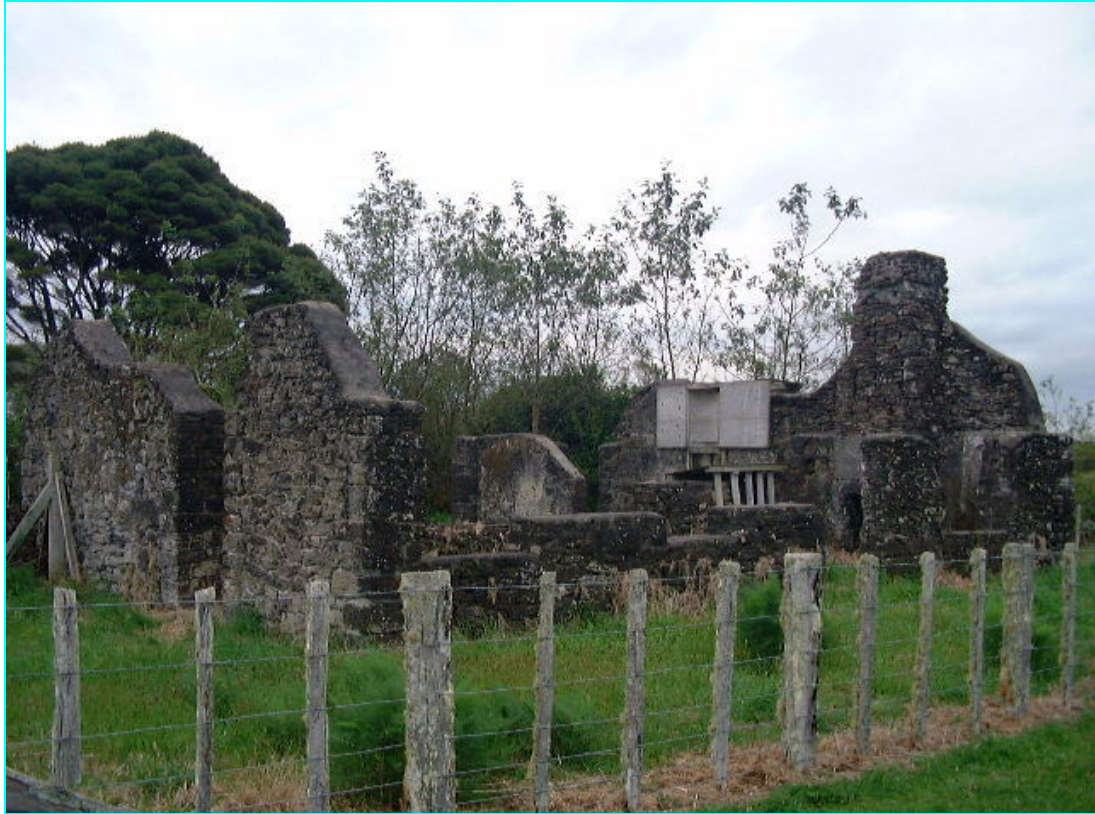
Edmonds Ruins, Kerikeri, May 1999.