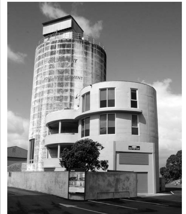
Former Raglan Wharf cement silos.

Built in 1964 by the Golden Bay Cement Company, the silos at Raglan Wharf had a previous life as storage for cement shipments from the South Island.