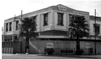
Looks can be deceiving when it comes to earthquake damage. Rosie's building did not show outward signs of significant damage to its street façades, but the brick walls were in bad shape – virtually to the point of collapse under the stress of the shake – some needing rebuild and others repair and strengthening. Photos left to right: after the earthquake (A Walters, Nicoll Blackburne Architects); essential rebuilding underway (G Henry, NZHPT), and completed (B Haynes, McCann 'ics).

The article noted the importance of weighing up options and impacts before irreversible decisions are made. Rosie's building is