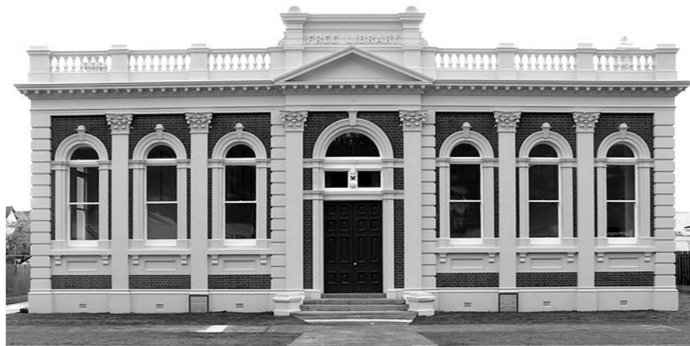
The library restored to its former glory.

The school, originally Pongakawa Village School, was built in 1933 for the tobacco industry in the region. It finally closed in 1986. If you miss the open day on 7 March and wish to find out more, visit: www.oldforestschool.com