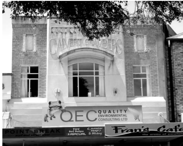
Calvert Chambers restored to its former splendour.